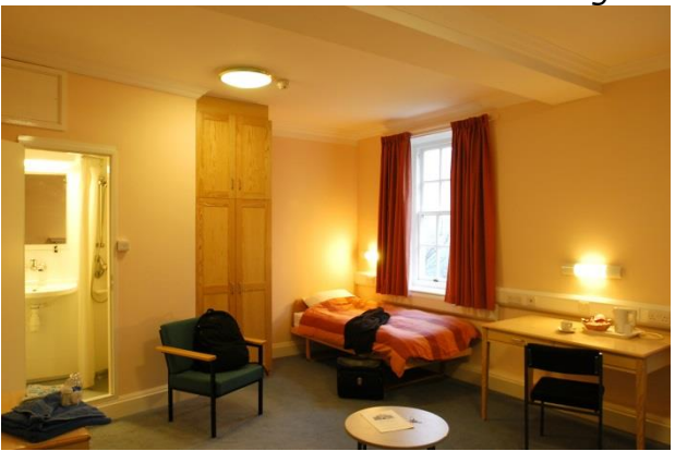
An en suite bedroom in our Pipe Partridge building