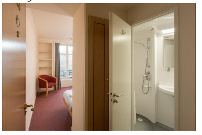
An en suite bedroom in our Sutherland building